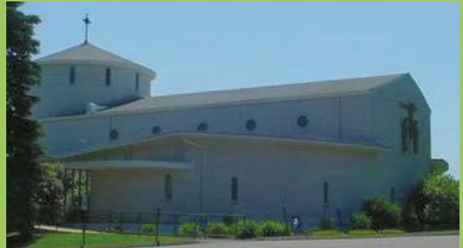
FIFTEENTH SUNDAY IN ORDINARY TIME JULY 14, 2024

Parish Office 860-643-4466 Parish Center 860-643-8374 Prayer Line 860-643-2837