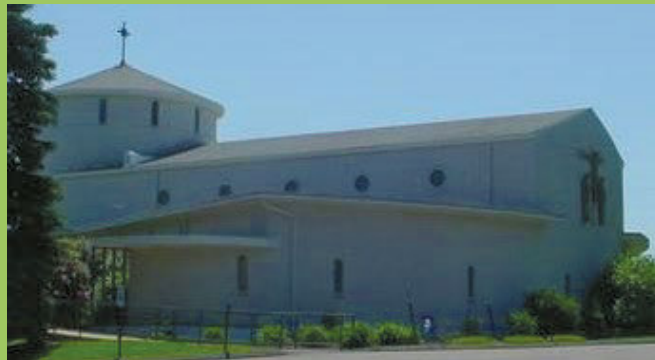
FOURTEENTH SUNDAY IN ORDINARY TIME JULY 7, 2024

Parish Office 860-643-4466 Parish Center 860-643-8374 Prayer Line 860-643-2837