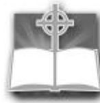
Mission Combined Collection

Last weekend the Mission Combined Collection for the World Mission Appeal, U.S. Bishop's Appeal for Latin America, Black and Indian Missions, and the Catholic Home Mission Appeal was taken up in our Parish.