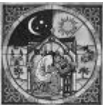
Liturgy of the Hours