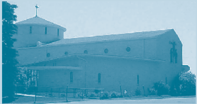
THE HOLY FAMILY OF JESUS, MARY AND JOSEPH DECEMBER 30, 2018

Rectory Phone 860-748-4560 Parish Office 860-643-4466 Parish Center 860-643-8374 Prayer Line 860-649-5449 or 860-643-2837