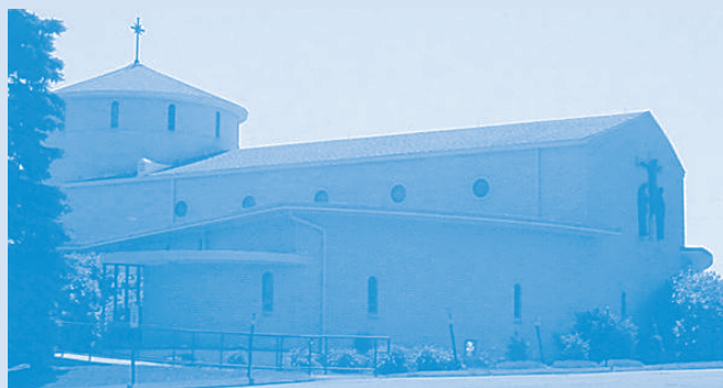
OUR LORD JESUS CHRIST, KING OF THE UNIVERSE

Rectory Phone 860-643-4466 Parish Center 860-643-8374 Prayer Line 860-649-5449 or 860-643-2837