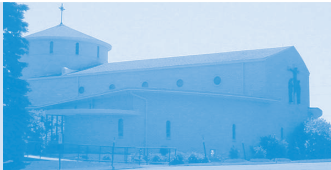
HOLY FAMILY OF JESUS, MARY, AND JOSEPH — DECEMBER 27, 2015

Rectory Phone 860-643-4466 Parish Center 860-643-8374 Prayer Line 860-649-5449 or 860-643-2837