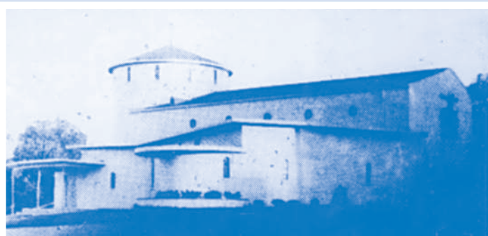
DEDICATION OF THE LATERAN BASILICA— November 9, 2014

Rectory Phone 860-643-4466 Parish Center 860-643-8374 Prayer Line 860-649-5449 or 860-643-2837