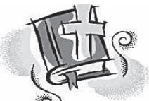
Faith Formation Registration

Cookies, cakes, pies, fudge, nut breads, etc. are all in great demand for the holidays! Donations were down last year. Please help us fill our Bake Sale booth to the brim with your delicious treats! Items can be dropped off Friday evening, November 21 or Saturday morning, November 22.