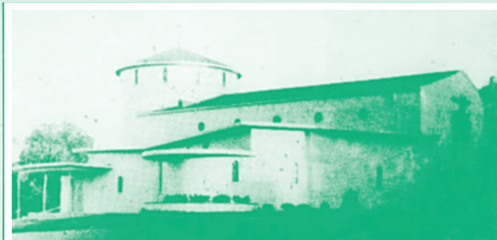
Twenty-Third Sunday in Ordinary Time September 7, 2014