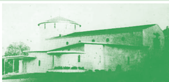
Twenty-Second Sunday in Ordinary Time August 31, 2014