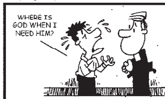
3rd SUNDAY OF LENT

"God's Plan for a Joy-filled Marriage". To register for the 3 session class call the Family Life Office at: 860-889-8346 ext. 283. Fri. April 4, 11, 25, 6:30pm-9:00pm at Our Lady of Lourdes, Gales Ferry.